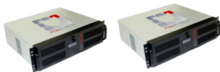
FoxServer range up to 100 channels